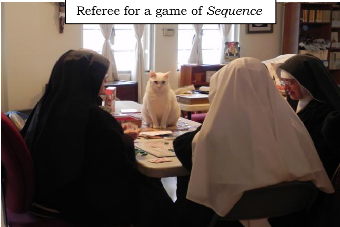
Referee for a game of Sequence