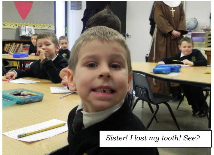
Sister! I lost my tooth! See?