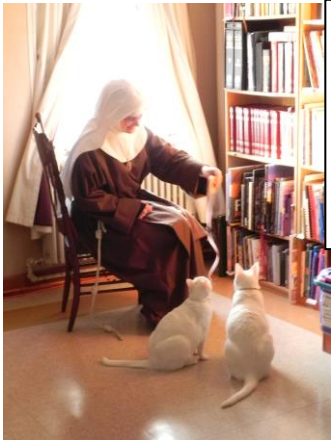
Our new brother and sister "mouse catchers" arrived by surprise on October 15 th . We named them Penny (left) and Cappuccino (or "Chino," right)