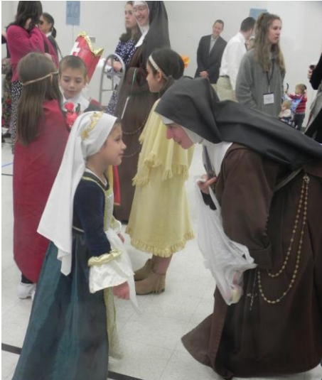
All Saints Day Party! The High School girls did an excellent job organizing the event.